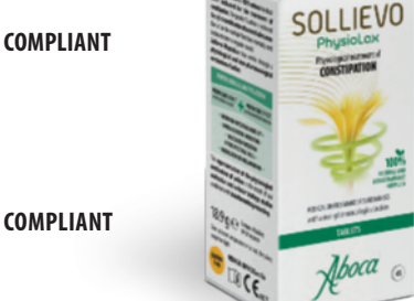
Contains 45 tablets of 420 mg each

Polyphenolic complex with flavonoids and sennosides ≥ 3.1%